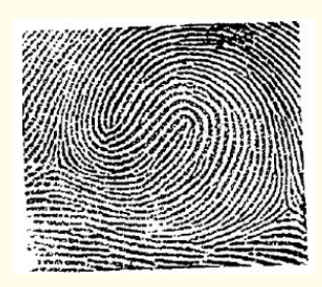
Figure 3: Counterclockwise/diagonal left.