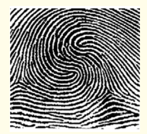
Figure 9: Counter Clockwise/horizontal (With enclosure above center).