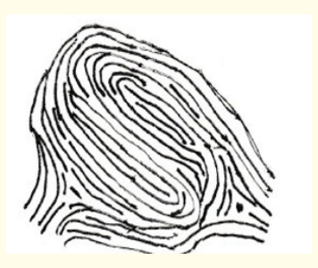
Figure 5: Counterclockwise/diagonal right (not found).